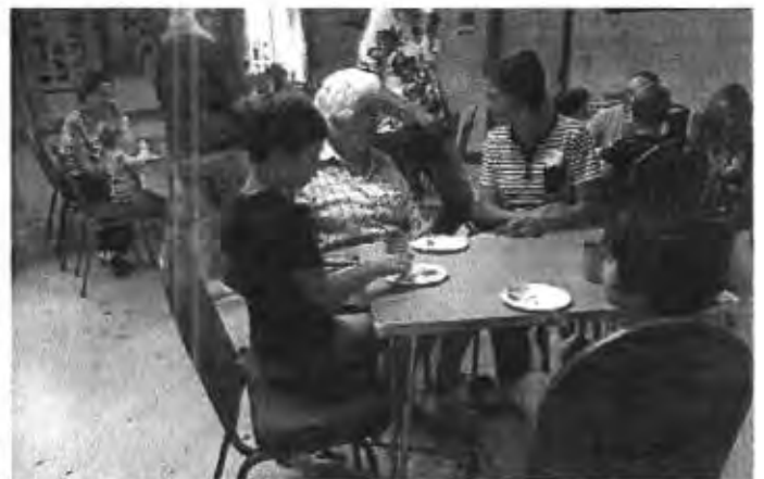
Villagers enjoying their tea especially the cakes.