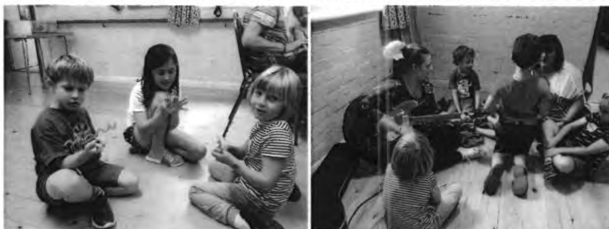
CHILDREN HAVING FUN PRINTED WITH PERMISSION OF PARENTS. MORE INSIDE (B & W)

THREE TOWERS COMMUNITY MAGAZINE SEPTEMBER 2019