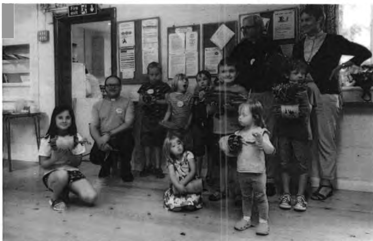
CHILDREN'S SUMMER WORKSHOP FOVANT VILLAGE HALL 12 TH AUGUST

YOUR VILLAGE & AREA NEWS AND MEETINGS ARTICLES VILLAGE AND AREA EVENTS POLICE REPORT ADVERTS